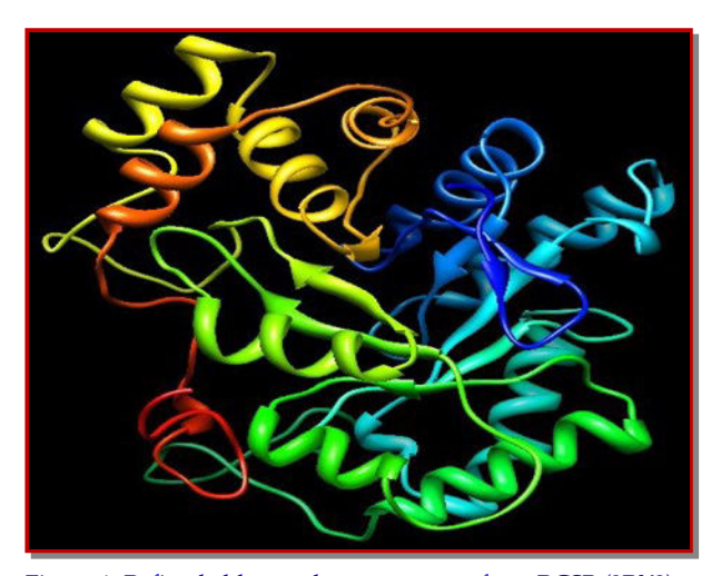
Figure 1: Refined aldose reductase enzyme from RCSB (3RX3)

than 3% of glucose consumption. However, in the presence of high glucose, the activity of this pathway is increased and could represent up to 30% of total glucose consumption (Yadav et al., 2009). Evidence for the involvement of ALR2 in diabetic neuropathy, retinopathy, nephropathy and cataract emerged from several independent studies (Guzman and Guerrero, 2005). Abnormal activation of the polyol pathway during diabetes leads to accumulation of osmotically active sorbitol leading to osmotic as well as oxidative stress, resulting in tissue injury (Dong et al., 2005; Saraswat et al., 2008).