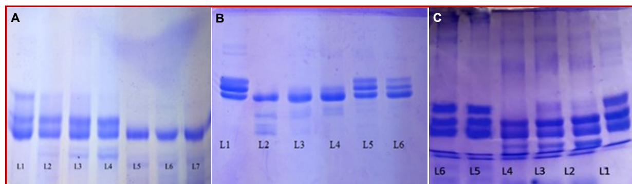
Figure 2: (A) Fibrinogenolysis induced by B. caeruleus and D. russelii venom at varying concentrations (5-15 µg). L1: Fibrinogen [F] (50 µg), L2-L4: F + B. caeruleus (5-15 µg) and L5-L7: F + D. russelii (5-15 µg); (B) Inhibition of fibrinogenolysis induced by D. russelii venom by different plant extract of C. serratum . L1: Fibrinogen [F] (50 µg), L2: F + DR + pet. ether, L3: F + DR + chloroform, L4: F + DR + ethyl acetate; L5: F + DR + methanol. DR= D. russelii ; (C) Inhibition of fibrinogenolysis induced by B. caeruleus venom by different plant extract of C. serratum . L1: Fibrinogen [F] (50 µg), L2: F + BC + pet ether, L3: F + BC + chloroform, L4: F + BC + ethyl acetate; L5: F + BC + methanol. BC= B. caeruleus